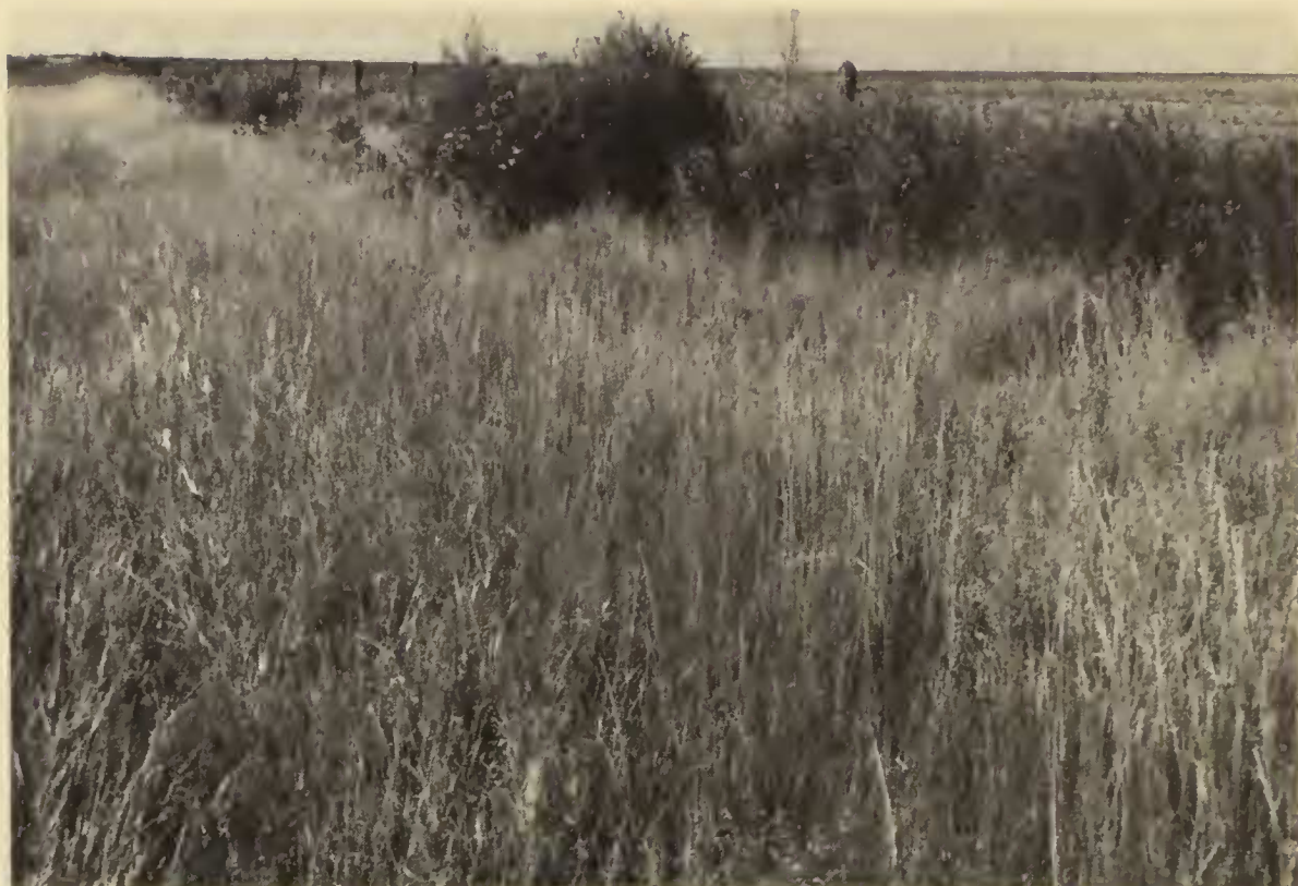
FIG. 17.—Roadside habitat where Microtus ochrogaster and six other species of small mammals were trapped, 8 mi. S Spearman, Hansford County.

not differ in chromosome number or fundamental number from those previously reported for M. ochrogaster .